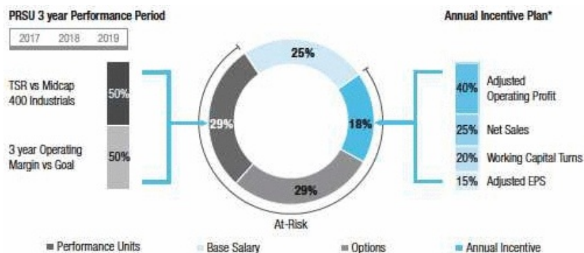
2017 NEO Incentive Compensation Structure (Average)

75% of NEO compensation “at risk” and aligned with company and shareholder success