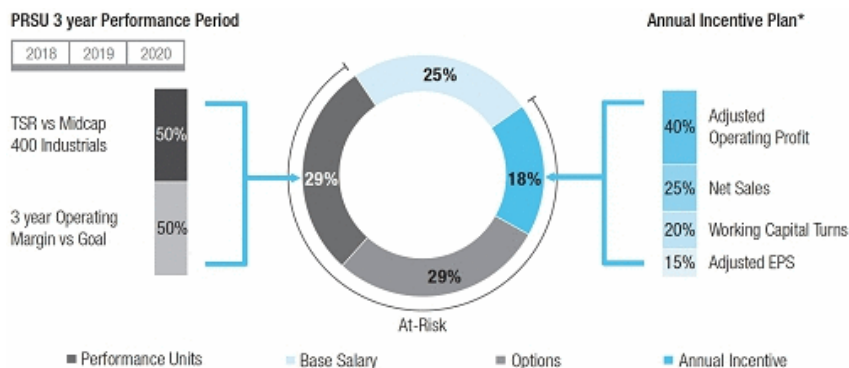
2018 NEO Incentive Compensation Structure (Average)

75% of NEO compensation "at risk" and aligned with company and shareholder success